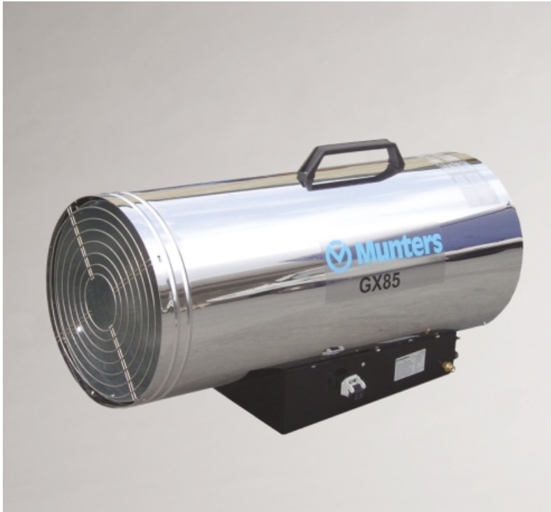
Photo shows fully equipped GX85.

The GX Portable Air Heaters are designed for cost effective spot heating.