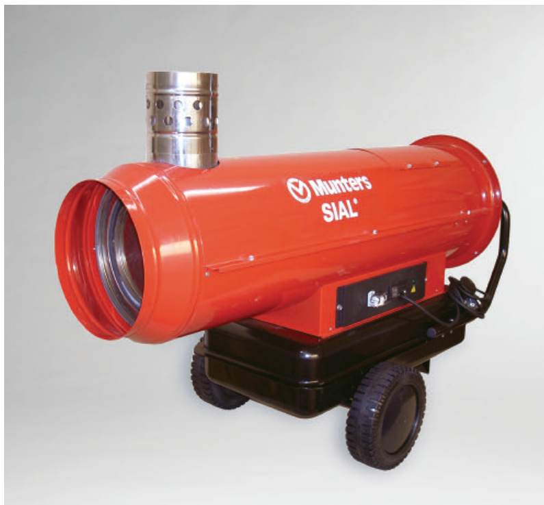
Photo shows fully equipped GF35.

The GF Mobile Air Heaters are designed for cost effective heating solutions in a wide variety of applications, including greenhouses, poultry houses and other livestock structures.