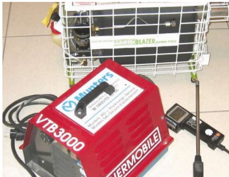
Necessary equipment for odour control of vehicles.