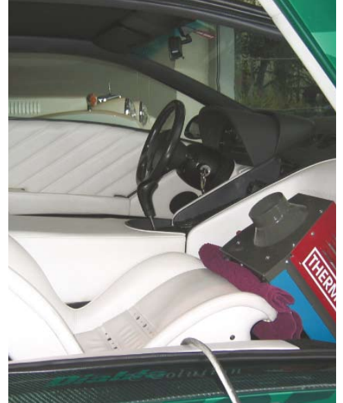
Heating unit, to pre-heat the car up to 50°C.

The competence and experience that Munters' technicians offer together with this innovative and highly effective procedure enable the effective neutralisation of odours in vehicles. The fresh and clean aroma will eventually diminish leaving a more neutral aroma. The effects of the procedure will last up to six months and only in very extreme cases will a repeat application be necessary. Since the procedure can only be implemented by trained Munters specialists, a perfect execution is ensured.