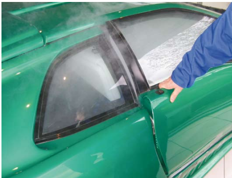
After treatment, the car has to be closed immediately.