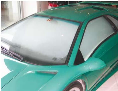
Nebula treatment continues for approximately 24 hours.