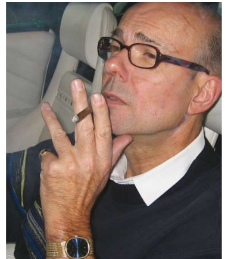
Munters' neutralisation solution eradicates smoke odour.