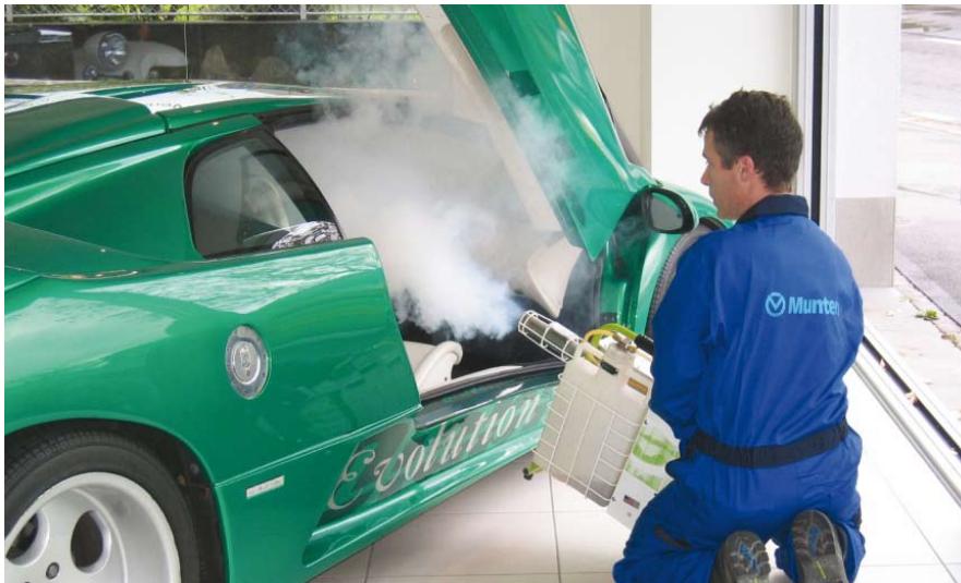
Drying nebula procedure to neutralise the interior of the car.

The drying nebula procedure uses neutralising substances and disinfectants which are sprayed in fine droplets within the affected area. Due to the small form of the substances, they can remain in the air for up to 15 hours, enabling them to penetrate deeply into effected materials fighting the bacteria that causes the odour. This method of neutralisation penetrates far deeper than conventional cleaning methods, making it a highly popular choice commercially, particularly for the resale of used cars.